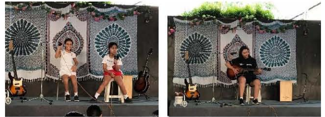
Open Mic activities